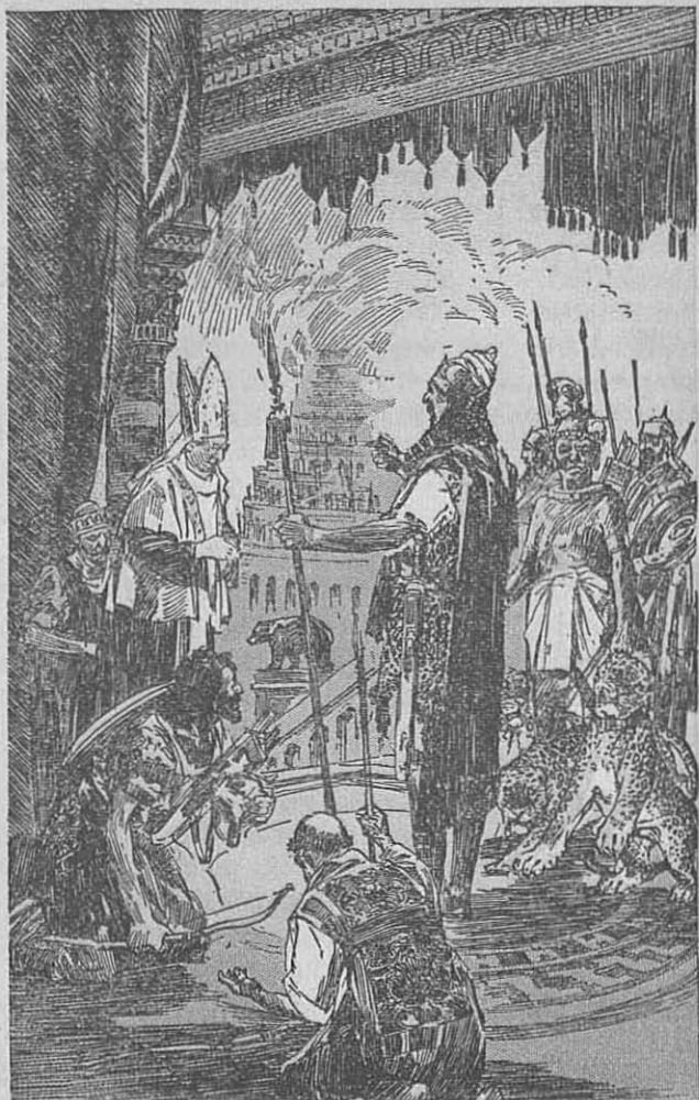
Practice of World Religion Begins