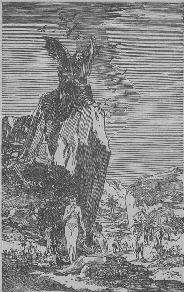
THE DEVIL CHALLENGES JEHOVAH